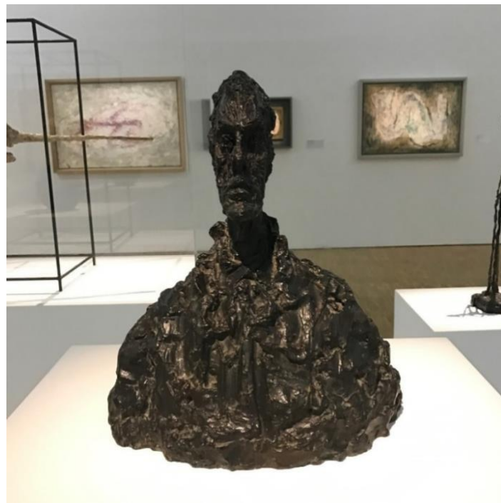
Fig. 3. Alberto Giacometti, Bust of Diego , 1954, Bronze, Centre Pompidou.

Moreover, the pitted surfaces of Giacometti's statues resemble wrinkled skin and suggest aging. Giacometti seldom burnished the surfaces of his sculptures produced after the surrealist period. The surfaces are mostly covered by a granulated texture, sometimes assimilated to their plinths, as if the flesh were decaying and covered by mud, or as if their clothes were ragged and badly worn (figure 3).