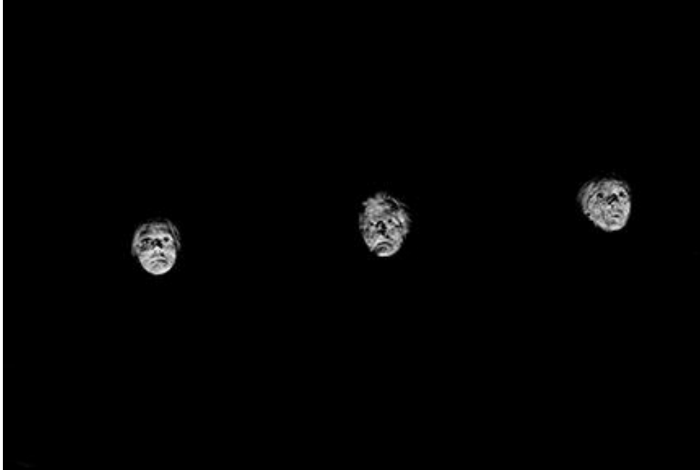
Fig. 6. Play , the Royal Court Theatre, London, 1976.

The audience can figure out the story of a love triangle by combining the characters' narratives. Although the plot is structured like a melodrama or a stereotypical romance, the dehumanized bodies in the symbolic urns form a stark contrast with the quotidian monologues. Their "impassive faces" and "toneless voices" (Beckett, Dramatic Works 307) indicate that they are alive and dead at the same time. In their article on Play , Beloborodova and Verhulst have already analysed the piece's shift from the human to the nonhuman in great detail. It could be added that the in-between state of the bodies in Play prompts a comparison not just with the funerary sculptures that Beckett appreciated because they "represent the dead [...] neither dead nor alive" (Ariès qtd. in Lozier 104) but also with Giacometti's sculptures and their oscillation between life and death.