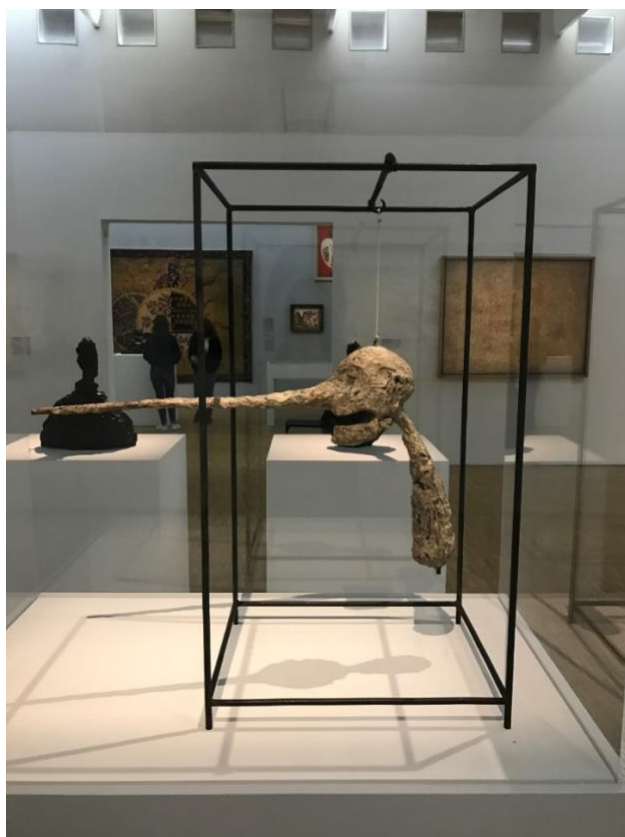
Fig. 9. Alberto Giacometti, Le Nez , 1947, Painted plaster, string, and metal, Centre Pompidou.

This terrifying vision of the dead accounts for the fragmented bodies, the skeleton shapes, the upturned faces, and the open mouths in his sculptures. Giacometti recalls that, in his dream, the head of the deceased “become[s] an object, a small box, measurable, insignificant” (29). Subsequently, Giacometti began to see the heads in a void. This explains why Giacometti modelled the skulls suspended or held up in the air, detached from the plinth. Liberated from realistic space, they become pure symbols of the residues of being. The traumatic spectacle of death Giacometti dreamt of generates the fragmented and reified corporeality of his sculptures.