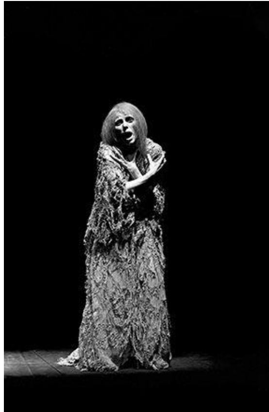
Fig. 4. Billie Whitelaw as May in the première production of Footfalls at Royal Court Theatre, London, in 1976.

repetitively and endlessly like a metronome, indicates that her soul, as symbolized by her ragged clothes, has been worn out by meaninglessness.