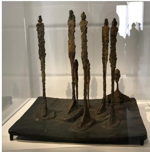
Fig. 8. Alberto Giacometti, The Forest , 1950, Bronze, Fondation Giacometti, Paris.

The images of immobilized or dying bodies in Beckett's theatre resonate with Giacometti's buried busts, as well as with his vision of being "alive and dead simultaneously" (Giacometti 30). Beckett