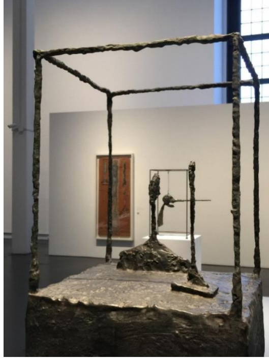
Fig. 7. Alberto Giacometti, The Cage , 1950, Bronze, Fondation Giacometti, Paris.