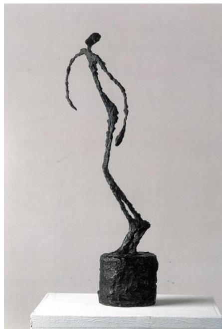
Fig. 2. Alberto Giacometti, Falling Man , 1950, Bronze, Musée Granet.

Another similarity between Giacometti’s statues and Beckett’s figures is their physical emaciation and debility. Giacometti’s post-war sculptures are marked by skeletal thinness. He reduced the volume of his sculptures to such an extent that the sculpted bodies are elongated and slenderized. This distortion situates them between figuration and abstraction, between living flesh and dry corpse, indicating undernourishment or destitution. This aesthetic partially results from Giacometti’s personal experiences during WWII, as he witnessed the devastation of lives during his exodus from Paris. Giacometti’s sculpture ‘Falling Man’ (‘Homme qui chavire’, figure 2), in particular, emphasizes corporeal frailty.