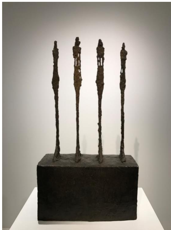
Fig. 1. Alberto Giacometti, Quatre femmes sur socle , 1950, Bronze, Fondation Giacometti, Paris.

clothes or ornaments. Their surfaces are mostly covered by a homogeneously rough texture. As Giacometti's sculpted heads become increasingly tiny, and the bodies are extremely slenderized, they gradually shed physical details (see figure 1). Beside anatomical detail and complicated positions, Giacometti also abolished individual characteristics by mixing the features of different models. Annette and Diego, in the series 'walking man' and 'standing woman', lose their particular traits. Indifferent, unidentifiable, they are generalized visualizations of human existence.