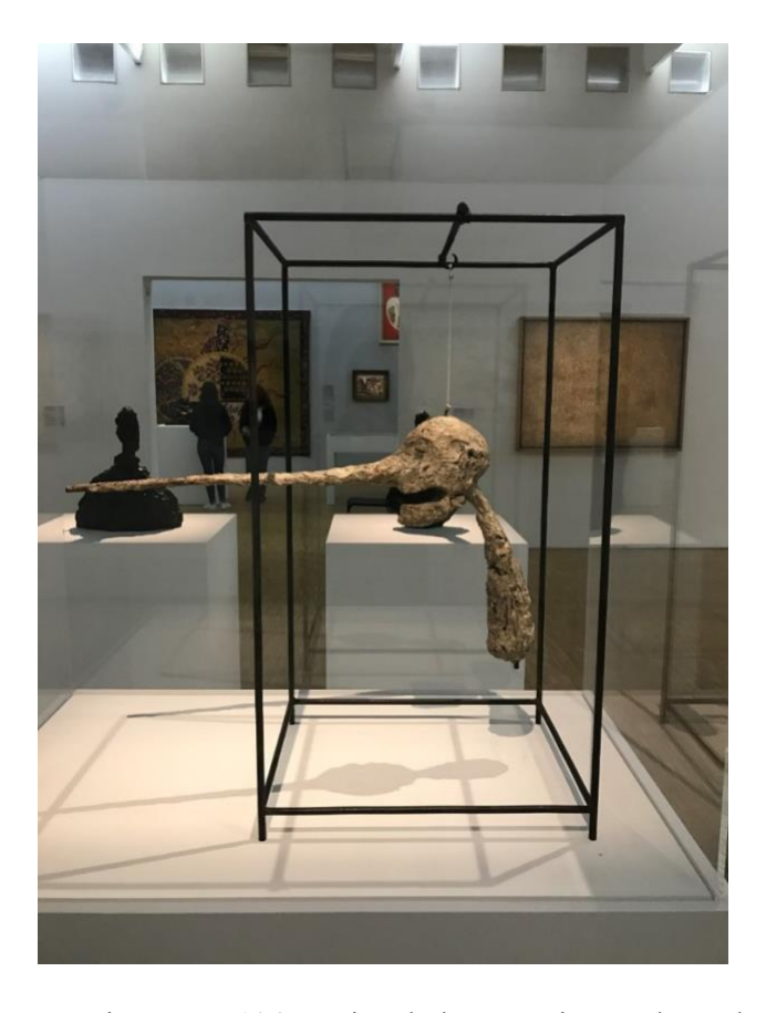
Fig. 9. Alberto Giacometti, Le Nez, 1947, Painted plaster, string, and metal, Centre Pompidou.

This terrifying vision of the dead accounts for the fragmented bodies, the skeleton shapes, the upturned faces, and the open mouths in his sculptures. Giacometti recalls that, in his dream, the head of the deceased "become[s] an object, a small box, measurable, insignificant" (29). Subsequently, Giacometti began to see the heads in a void. This explains why Giacometti modelled the skulls suspended or held up in the air, detached from the plinth. Liberated from realistic space, they become pure symbols of the residues of being. The traumatic spectacle of death Giacometti dreamt of generates the fragmented and reified corporeality of his sculptures.