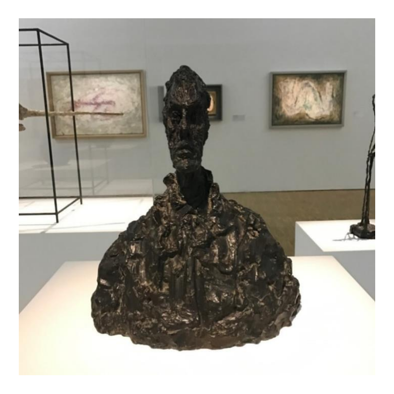
Fig. 3. Alberto Giacometti, Bust of Diego, 1954, Bronze, Centre Pompidou.

Moreover, the pitted surfaces of Giacometti's statues resemble wrinkled skin and suggest aging. Giacometti seldom burnished the surfaces of his sculptures produced after the surrealist period. The surfaces are mostly covered by a granulated texture, sometimes assimilated to their plinths, as if the flesh were decaying and covered by mud, or as if their clothes were ragged and badly worn (figure 3).