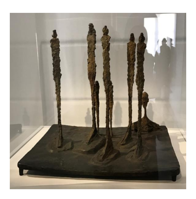
Fig. 8. Alberto Giacometti, The Forest, 1950, Bronze, Fondation Giacometti, Paris.

The images of immobilized or dying bodies in Beckett's theatre resonate with Giacometti's buried busts, as well as with his vision of being "alive and dead simultaneously" (Giacometti 30). Beckett