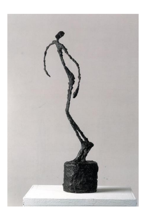
Fig. 2. Alberto Giacometti, Falling Man, 1950, Bronze, Musée Granet.

Another similarity between Giacometti's statues and Beckett's figures is their physical emaciation and debility. Giacometti's post-war sculptures are marked by skeletal thinness. He reduced the volume of his sculptures to such an extent that the sculpted bodies are elongated and slenderized. This distortion situates them between figuration and abstraction, between living flesh and dry corpse, indicating undernourishment or destitution. This aesthetic partially results from Giacometti's personal experiences during WWII, as he witnessed the devastation of lives during his exodus from Paris. Giacometti's sculpture 'Falling Man' ('Homme qui chavire', figure 2), in particular, emphasizes corporeal frailty.