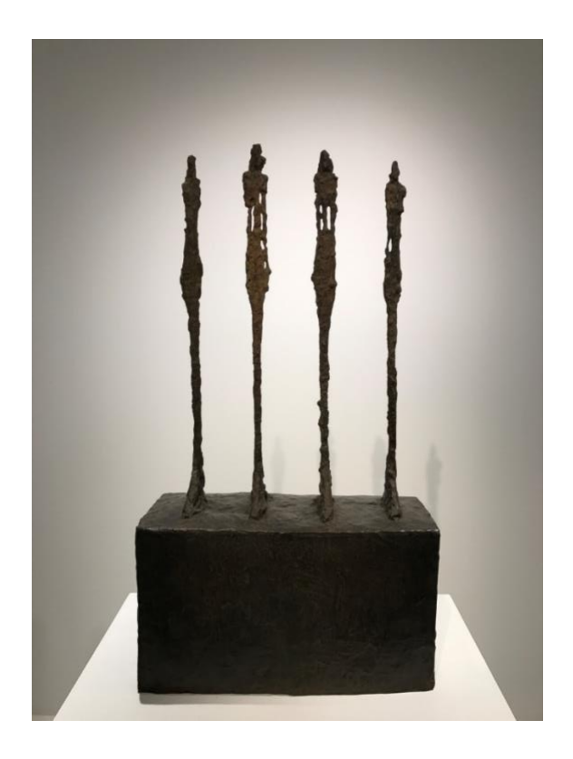
Fig. 1. Alberto Giacometti, Quatre femmes sur socle , 1950, Bronze, Fondation Giacometti, Paris.

clothes or ornaments. Their surfaces are mostly covered by a homogeneously rough texture. As Giacometti's sculpted heads become increasingly tiny, and the bodies are extremely slenderized, they gradually shed physical details (see figure 1). Beside anatomical detail and complicated positions, Giacometti also abolished individual characteristics by mixing the features of different models. Annette and Diego, in the series 'walking man' and 'standing woman', lose their particular traits. Indifferent, unidentifiable, they are generalized visualizations of human existence.