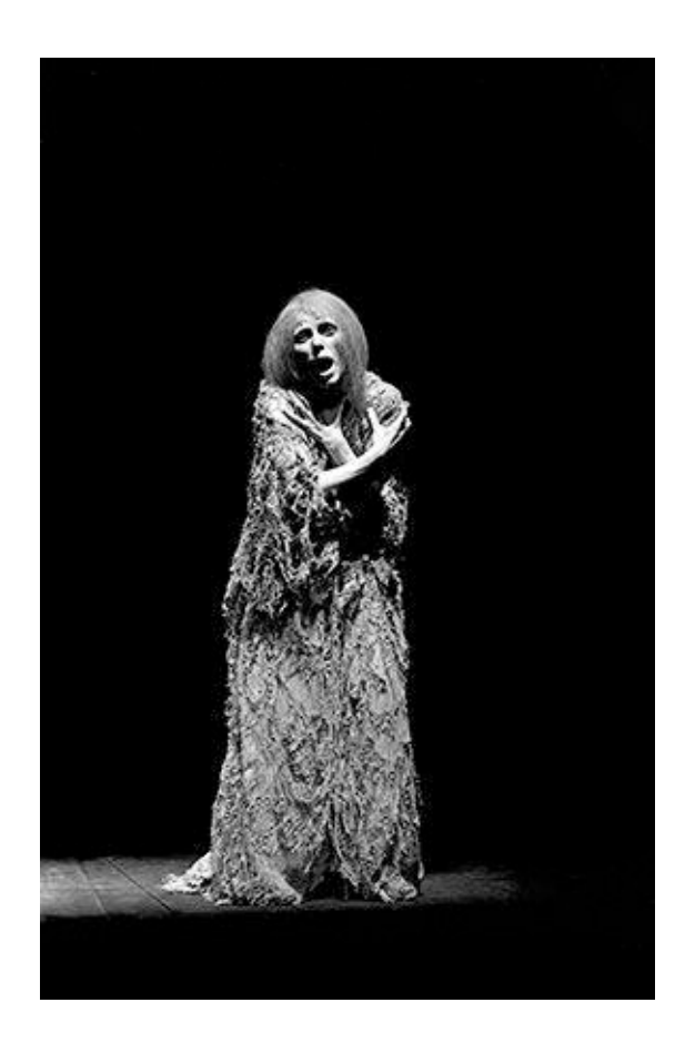
Fig. 4. Billie Whitelaw as May in the première production of Footfalls at Royal Court Theatre, London, in 1976.

repetitively and endlessly like a metronome, indicates that her soul, as symbolized by her ragged clothes, has been worn out by meaninglessness.