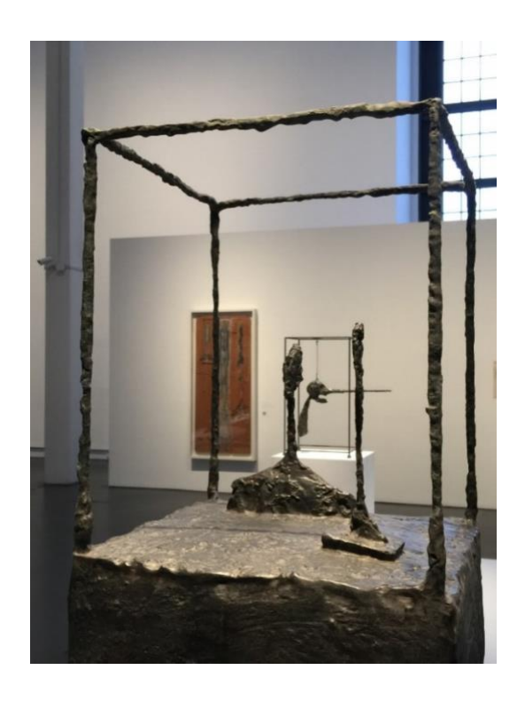
Fig. 7. Alberto Giacometti, The Cage, 1950, Bronze, Fondation Giacometti, Paris.